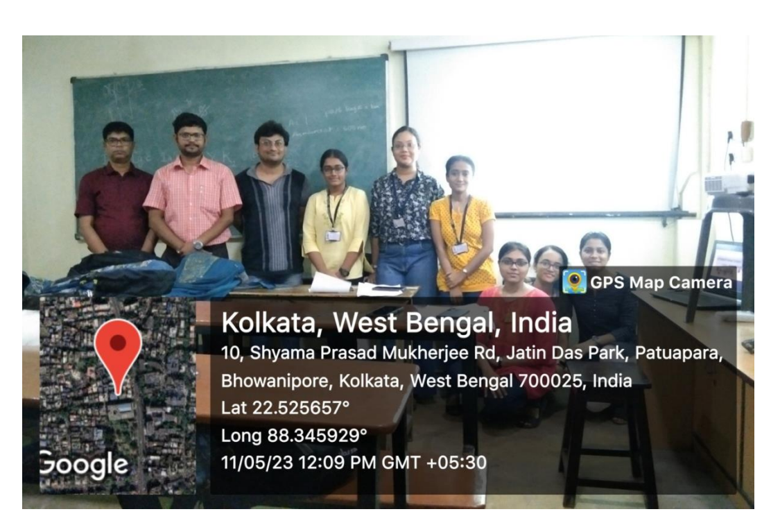
2<sup>nd</sup>: Group A with Teachers