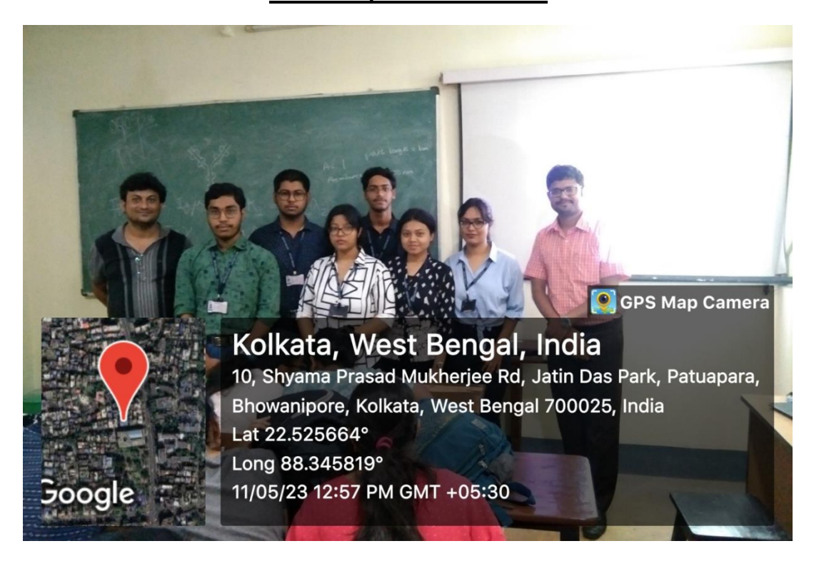
3<sup>rd</sup> : Group D with Teachers